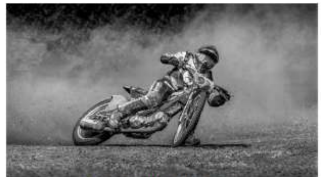
138 Grasstrack Bike Rider Ian Roberts DPAGB