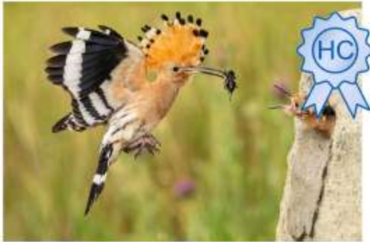
131 Hoopoe Deliveroo Phil Shaw FRPS