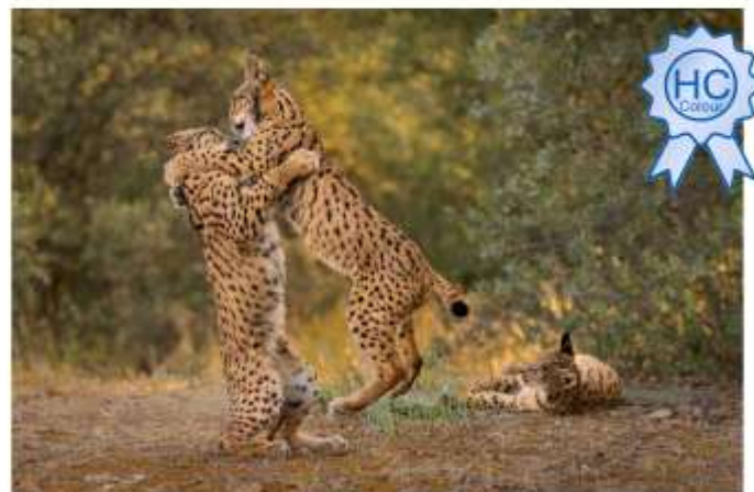
136 Iberian Lynx Kittens Playfighting