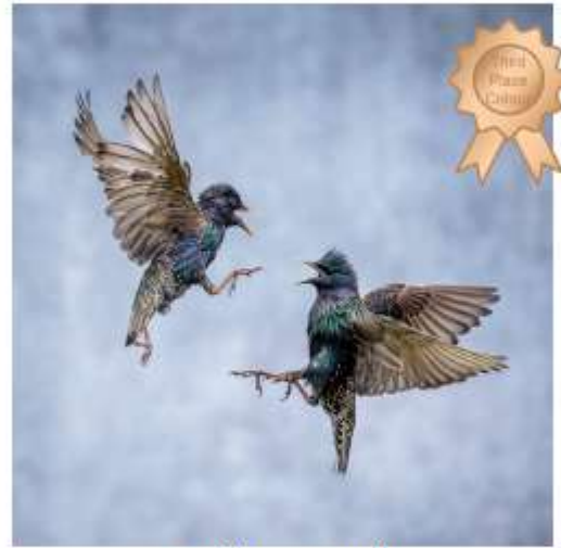
132 Iridescent Starlings Julia Wainwright FRPS EFIAP MPAGB BPES*