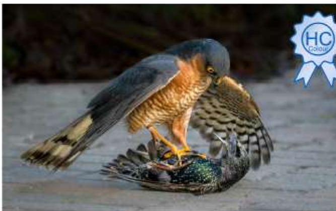
135 Sparrowhawk with Starling Jim Munday EFIAP/g DPAGB BPE4*